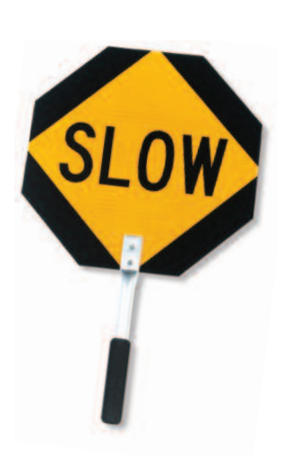
BK325ENG Engineer Grade Stop/Slow Paddle