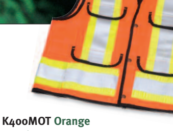
Poly/Cotton Supervisor Safety Vest

Poly/cotton safety vest c/w mesh top and mesh sides, 5 front pockets, 2 inside pockets, 2 microphone clips and radio pocket on left side. 4" 3M reflective tape. Meets WCB and CSA Z96-02 Class 2 Level 2. Sizes: S-3XL.