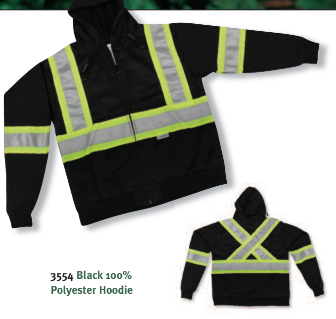
Polyester hoodie c/w hand pouch. Full zipper front and 4" 3M reflective tape. Meets CSA Z96-o2 Class 2 Level 1. Sizes S-5XL