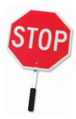
BK325DG Aluminum Diamond Grade Stop/Slow Paddle